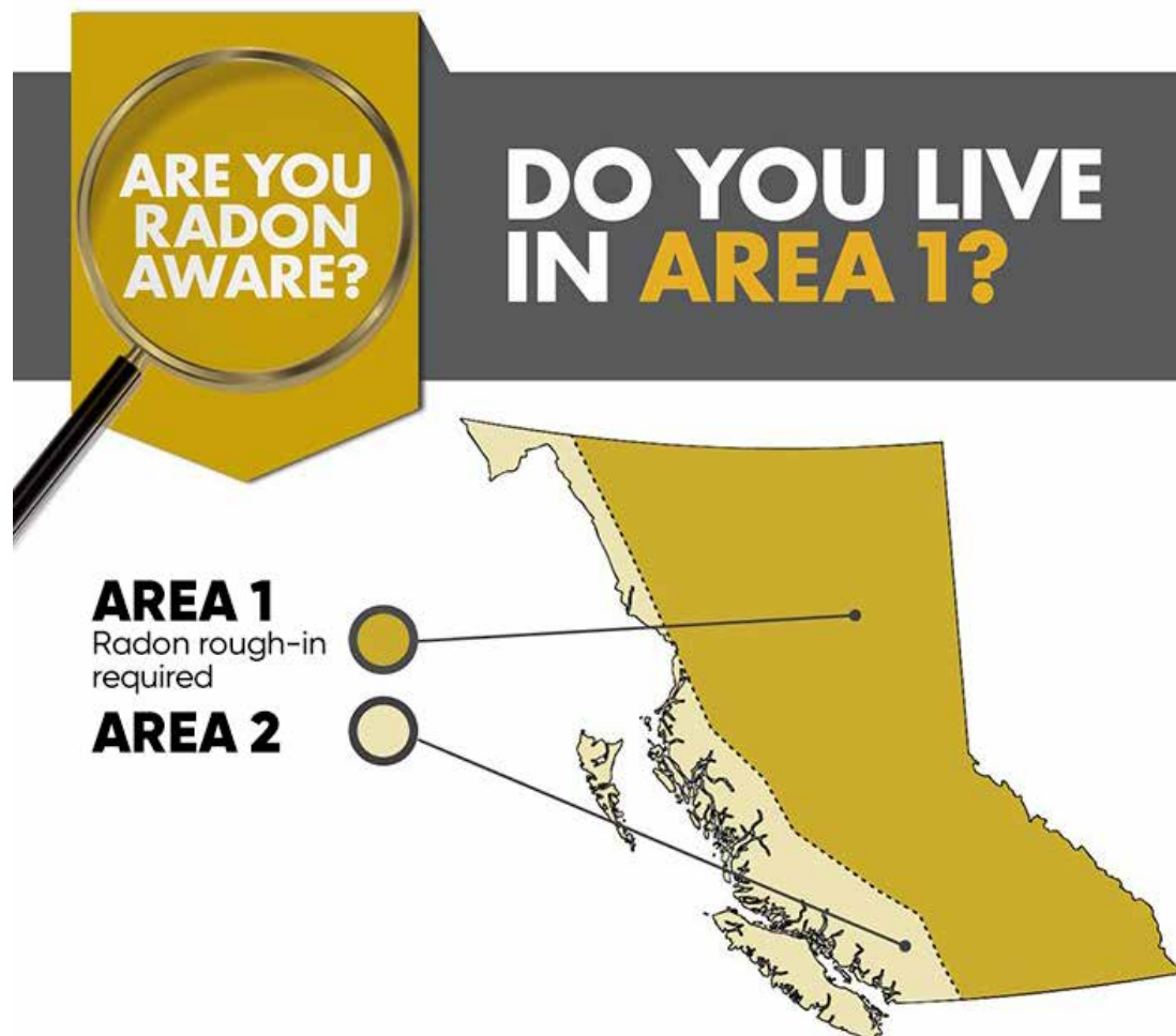
Figure 3 - Geographical separation of Radon Areas 1 and 2 in British Columbia, Canada [9]

Most provinces have implemented radon protection measures for new construction, but the degree of radon mitigation varies. Some provinces only require the bare minimum Level-1: Rough-in as specified in the 2015 National Building Code, while British Columbia mandates Level-2: Passive Stacks in radon-prone areas. It is the responsibility of the municipalities to enforce the building code, which plays a crucial role and should be carried out with the necessary standard of care. Building inspectors should also receive adequate training on radon and radon mitigation systems