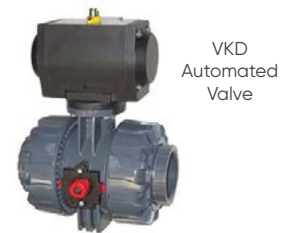
VKD Automated Valve

When leaks are not an option , whether it be an off-the-shelf system or a customized solution, IPEX double containment piping systems will keep you dry.