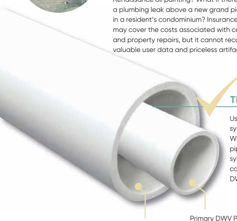
Primary DWV Pipe